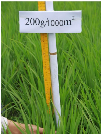
Rice plants treated with BiOWiSH® were ready for transplant earlier than plants in the control group.

Researchers studied the effectiveness of adding BiOWiSH® Crop to standard farming practices in the region. Under a variety of conditions, BiOWiSH® Crop improved broad-acre maize and rice crops. The maize plants treated with BiOWiSH® Crop had higher yields and higher grain kernel weights, resulting in an optimized yield. In the rice tests, growers also experienced optimized yield of more than 8 percent. BiOWiSH® Crop also improved the number of rice grains per spike and the seed rate.