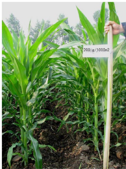
Researchers determined an application rate of 200 g/1000 m² yielded the best results.