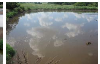
Wastewater lagoon AFTER BiOWiSH™ Treatment