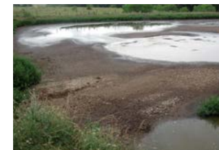
Wastewater lagoon BEFORE BiOWiSH™ Treatment

*Study performed by an independent third-party engineering firm.