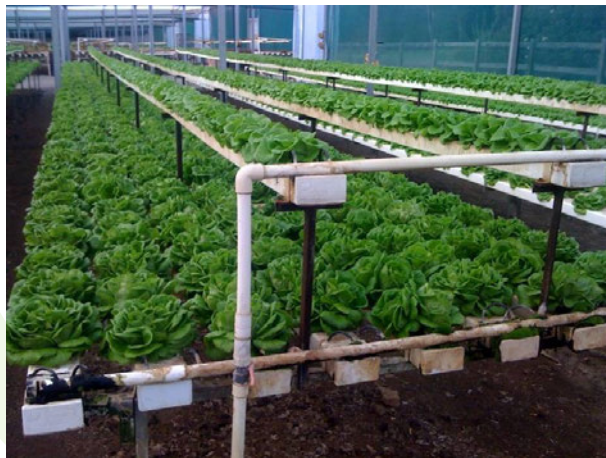
Green Butter Lettuce on Nutrient Film Technique (NFT) Growing System

The NFT systems are irrigated with water circulated through a 1 x 1,056 Gal tank per greenhouse.