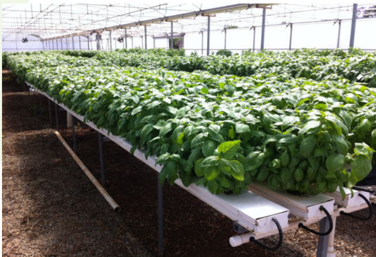
Treated Sweet Basil growing in the Greenhouse on NFT tables

After harvesting a “control” crop, A & D Manno Hydroponics applied BiOWiSH™-Hydroponic in addition to the traditional program for the next growth cycle. Both treatment protocols measured yield and Brix (sugar content measure) in Bok Choy and Brix in Sweet Basil, while also observing health and vigor of all plants in the system.