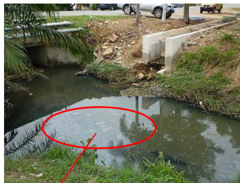
Oil and Grease contamination on the river's surface