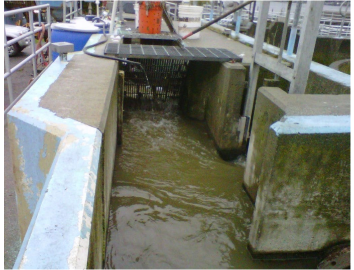
Splitter channel and the dosing drums (in blue on the left). The trickle feed tube is fixed to the metal grate.