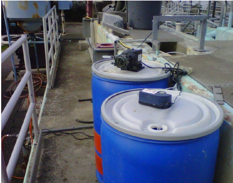
BiOWiSH® dosing setup