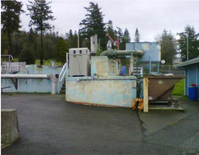
Headworks to the Mission Beach WWTP. The overall condition of the plant is well-maintained and the existing treatment system consistently meets permit conditions.