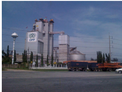
CP Feed Mill Site

The drying process releases a wide range of volatile organic odors including mercaptans, amines, ammonia, hydrogen sulphide. These emissions were the cause of constant complaint and in the wet season, complaints were received from up to 12 miles (20km) bordering the Bangkok CBD.