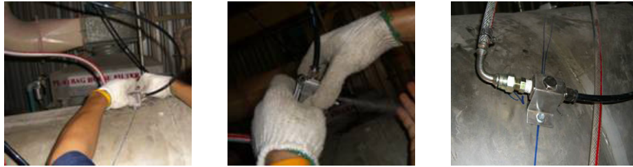
Installation of Nozzles

BiOWiSH™ Odor was mixed into solution and applied at 7oz (200gm) into a 53Gal (200L) reservoir (1,000ppm). The solution was then delivered via 8 nozzles in spiral formation along the stack at 1.3 Gal (5L) of solution per nozzle per hour. The usage of BiOWiSH™ Odor is 1.75oz (50gm) per hour.