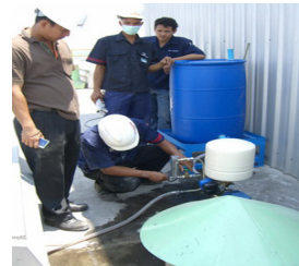
Pump Unit and Reservoir