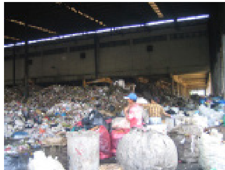
Bangkok Metropolitan Site