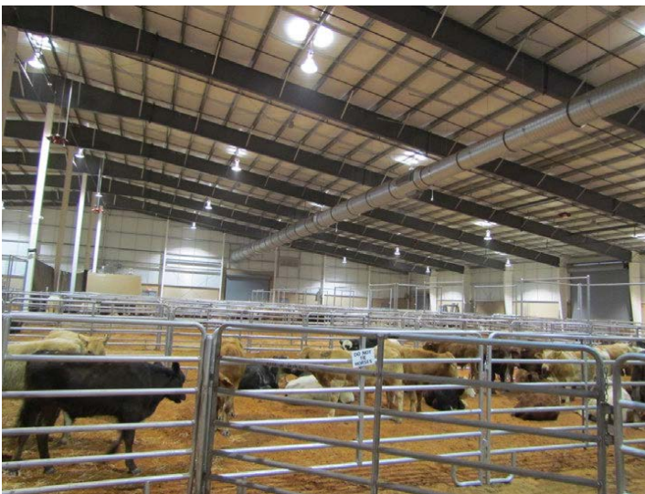
Cattle holding area of the Horse Show Arena